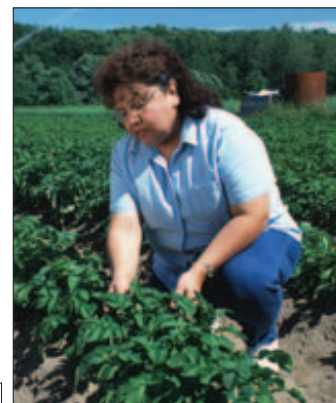
ABOUT 45,000 migrant workers are employed in the state during the summer.

Migrant labor is used to produce 24 crops in the state including floriculture/