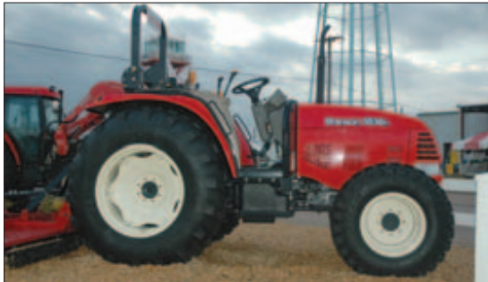
30 SERIES: Branson Tractor Co.'s new 30 Series features two models in cab or ROPS variation with either a 55-horsepower turbo-diesel or a 65-hp Cummins naturally aspirated diesel. Both have 12-by-12 transmissions with a manual creeper gear.

a tilting steering wheel connected to power steering, a convenient instrument cluster and centralized control levers for better handling.