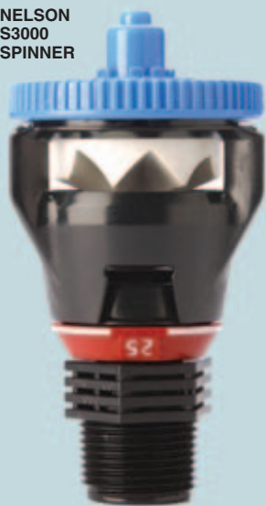
NELSON S3000 SPINNER