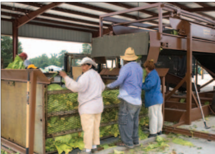
END OF THE LINE: The tobacco comes over the top of the loader and is distributed into boxes. Workers are waiting to push rods in and pull the box over on rollers.