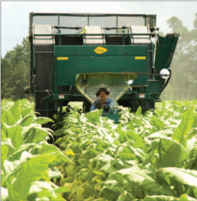
IN THE FIELD: This harvester has a large holding capacity for storing cropped tobacco until it can be unloaded.