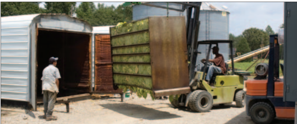
IRON MUSCLE: A forklift efficiently moves a box of tobacco into the curing barn, even as another is being filled.