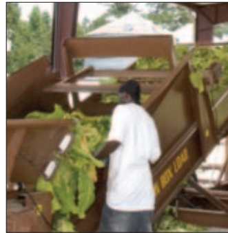
DOUBLE CHECK: A worker watches to make sure the transfer of the tobacco from the converted school bus to the box loading system goes smoothly. Note the paddle system for spreading the tobacco.