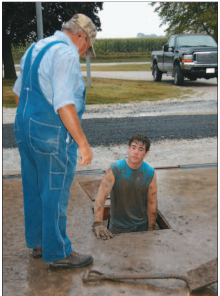
SPOTLESS: Note the lack of mud on Grandpa; he gave up this job a long time ago.