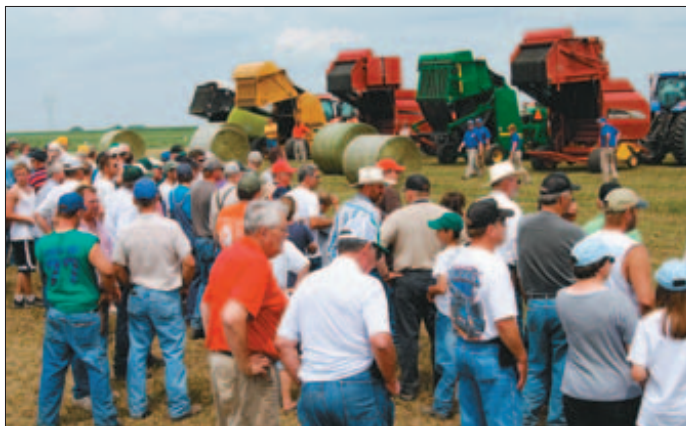
BALER LINEUP: Competing baler manufacturers will exhibit their equipment's capabilities in a side-by-side demonstration at the 2008 Farm Progress Hay Expo.

Fourteen other counties had yields five bushels or more below trend: Bond (116), Edwards (113), Hamilton (110), Hardin (112), Jefferson (95), Macoupin (157), Madison (127), Monroe (128), Perry (79), Pike (156), Richland (110), St. Clair (123), Wabash (130) and Washington (105).