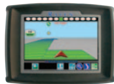
In-cab view of Raven's new AccuRow automatic planter section control function with Envizio Pro multi-function field computer.

AccuRow's GPS-guided on-off section control delivers precision planting where you need it most—at end rows, point rows and everywhere in between. With AccuRow, it's automatic. And that makes life easier with faster, more accurate planting and by eliminating problems associated with cross planting.