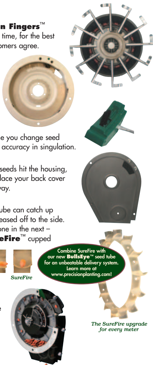
The SureFire upgrade for every meter

To really repower your planter – or optimize your new one – choose complete Precision Meters™ , with all of these components, all designed and tested to work together for maximum precision and maximum yields.