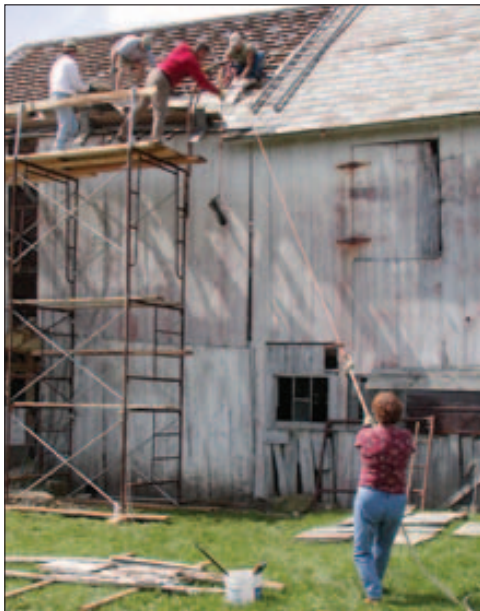
ROOF REPAIR: Slate will last for decades if it is properly maintained.