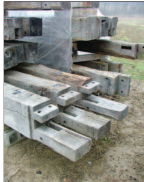
FUTURE FLOORS: Timbers from barns are sawed into extensive oak or chestnut flooring.