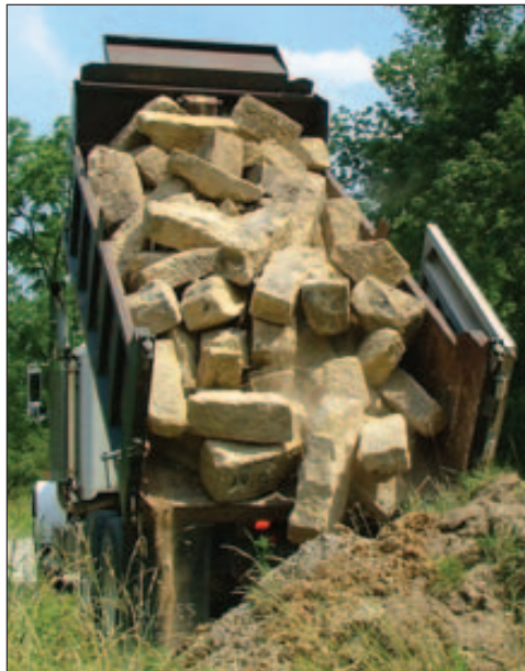
STANDING STONE: Foundation stones are in high demand by landscapers.