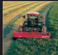
NEW SERIES: MacDon's new M series windrowers come in M150 and M200 (shown) models with upgraded engines for more efficient harvesting and a tall, wide stance for windrow clearance.