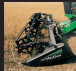
THREE-SECTION HEAD: The new MacDon FD70 draper features a three-section flex technology that can be locked into a single rigid unit for all types of field conditions. The FD70 comes in 30-, 35-, and 40-foot widths.

available for most current model combines (Class 6 up to Class 9) and comes in 30- and 35-foot versions for those wanting a smaller header.