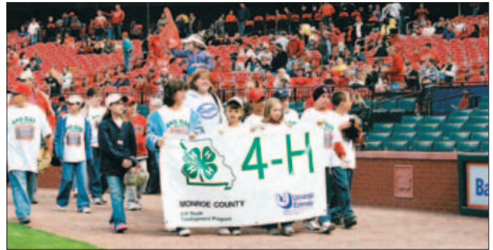
4-H MEMBERS from Monroe County take part in the pregame parade around the infield at the new Busch Stadium in St. Louis.

Both Missouri and Illinois 4-H foundations use the day to generate funds for college scholarships. By raffling off