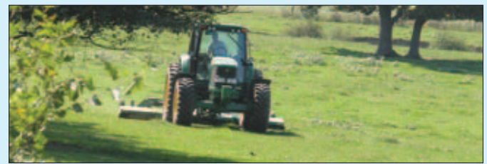
AN EXPENSIVE TRIM: Whether trimming pastures or cutting hay, the cost of custom mowing rose 9%, according to Pennsylvania's custom rate survey.